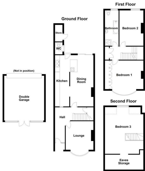
Not to scale. For illustrative purposes only

You may download, store and use the material for your own personal use and research. You may not republish, retransmit, redistribute or otherwise make the material available to any party or make the same available on any website, online service or bulletin board of your own or of any other party or make the same available in hard copy or in any other media without the website owner's express prior written consent. The website owner's copyright must remain on all reproductions of material taken from this website.